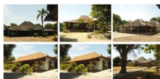
Figure 2. Prototype of Dalem Pangeran (Modified by Writer) [10]

In conservation practice in village of kampong Karaton there applies prompt-purpose technology always initiated preliminary with aerchological research and information data search in past time and needs of documentation making in future. That technological application has often relation to economical value or cost when in developed country then it will be most significant and prerequisite in process of renovation, either for space, building, or building element at hand. Besides there must be independent management heading to a self supporting operation in its implementation process.