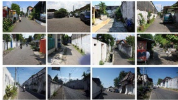
Figure 4. Prototype of street in vicinity of Karaton (Modified by Writer) (PEMDA Surakarta, RTBL Kampung Baluwerti of Surakarta City of 2010) [10]