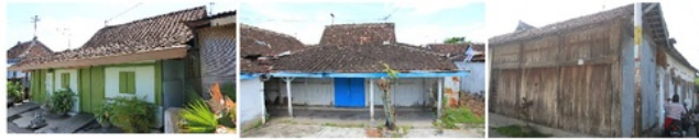
Figure 3. Residential Prototypes of Abdi Dalem & Sentana Dalem