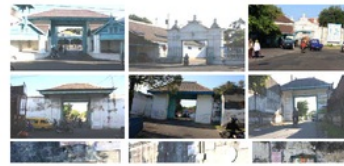
Figure 5. Prototype of Entrance Gate of Complex of Karaton Kasunanan Surakarta (Modified by Writer) (District Administration of Surakarta, RTBL Kampung Baluwerti of Surakarta of 2010) [10]

From analysis process thus there is result; village of kampong Karaton has cultural potential high sufficient as in physics or non physics, therefore from economical side, kampong karaton is considered to be appropriate to use model of Basic Model Maximizing Welfare , due to all potentials owned by kampong karaton. In conservation implementation thus it must be initiated into action of archeological research and information data search in past time and documentation-making in field. The latter is important as research subject when performing conservation in field. From overall process either in conservation implementation or tourist management process on visit event thus it takes favorable management as well as time discipline as well as environmental cleanliness.