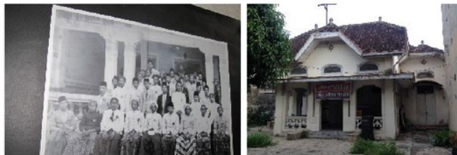
Fig. 5. The Sarekat Dagang Islam meeting in Laweyan in 1911