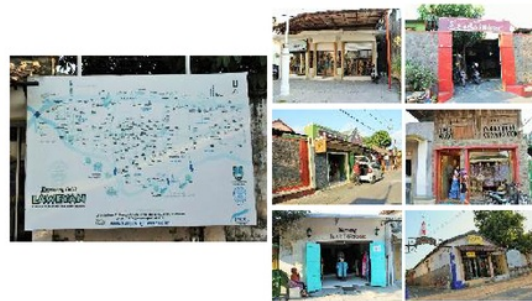
Fig. 4. Map and sample of the place where batik business in laweyan