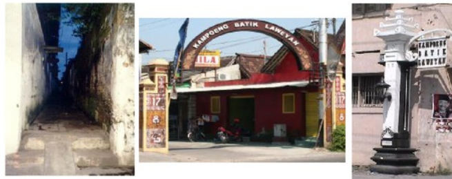
Fig. 3. Hallways and writing as a sign (Source: Personal Data, 2017)