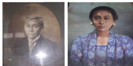
Fig. 2. Prototype Mbokmase and Masnganten Laweyan