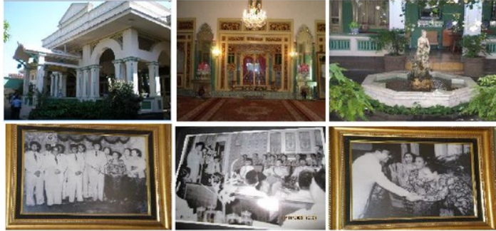
Fig. 7. The visit of President Soekarno in 1950 to Laweyan was entertained at the Cokrosoemarto family