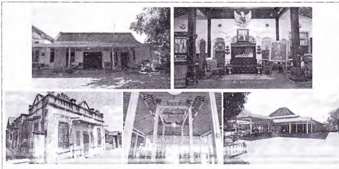
Figure 5. Prototype of Pangeran house.