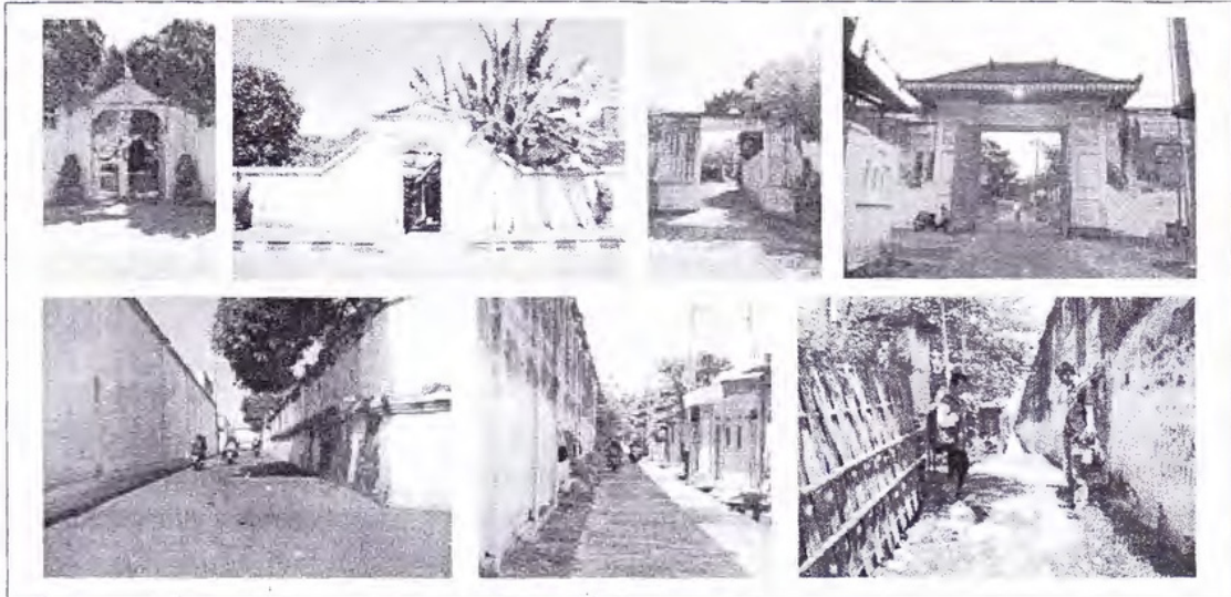
Figure 3. Prototype of gates in "kampung" Baluwerti.