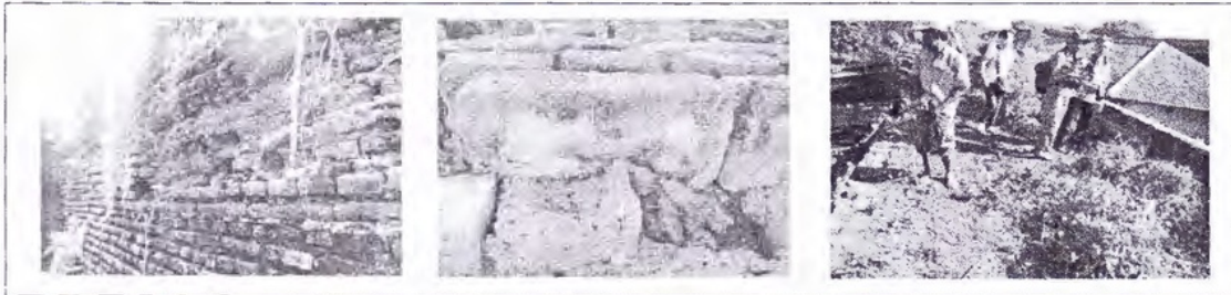
Figure 4. Ruin of masonry wall (the surrounding wall of Paku Buwono II's era).