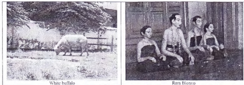
Figure 6. Examples of symbol in the palace as an attempt to demonstrate the power of the king.

This regard is done with intention to seek the loci estimated to store theoretical samples related to research focus. For locus suspected to store the discrete phenomena (acronym from continue) such as social situation related to research focus and proper to designated as a theoretical sample, it is immediately conducted with mini grand tour (visceral observation) and with the objective of determining the observed units.