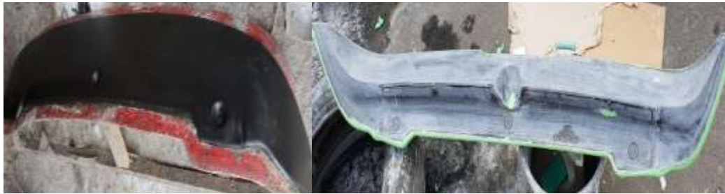
b. Manufacturing process of car spoiler