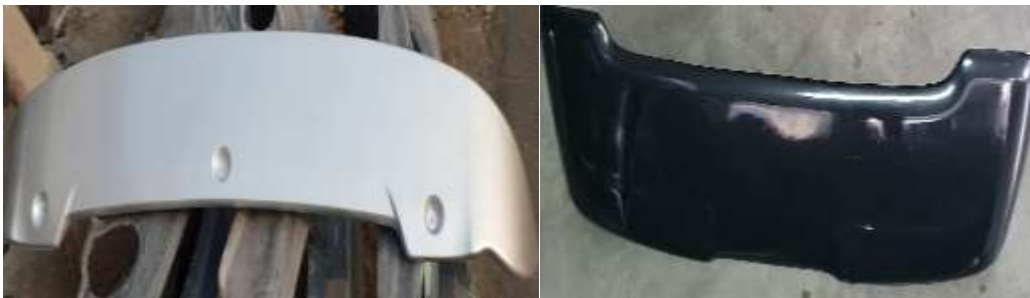
c. Product prototype of spoiler