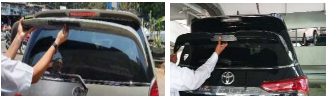
Figure 4 Product prototyping of car spoiler using rattan fiber composite

The process of developing a car spoiler product using rattan fiber composite materials has succeeded in making a prototype of a car spoiler product that is ready for use. Based on the research that has been done and the manufacturing process of car spoilers, it can be concluded that continuous rattan fiber in the form of weaving can be used as a raw material for making spoilers. However, from the prototype of the spoiler product that has been successfully developed, it is necessary to test and develop the best production process methods so that the product is strong and able to meet the aesthetic element, therefore they can be used by consumers as accessory products installed in cars and sold to the market (Figure 4) [1], [2], [19] - [21].