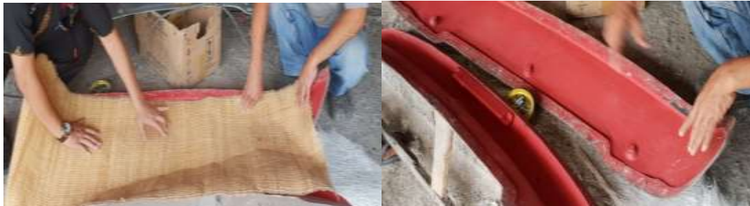
a. Preparation of rattan fibers and positive molds