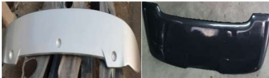
c. Product prototype of spoiler