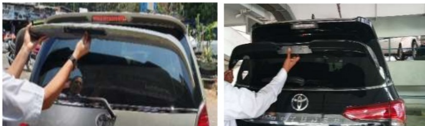
Figure 4 Product prototyping of car spoiler using rattan fiber composite

The process of developing a car spoiler product using rattan fiber composite materials has succeeded in making a prototype of a car spoiler product that is ready for use. Based on the research that has been done and the manufacturing process of car spoilers, it can be concluded that continuous rattan fiber in the form of weaving can be used as a raw material for making spoilers. However, from the prototype of the spoiler product that has been successfully developed, it is necessary to test and develop the best production process methods so that the product is strong and able to meet the aesthetic element, therefore they can be used by consumers as accessory products installed in cars and sold to the market (Figure 4) [1], [2], [19] - [21].