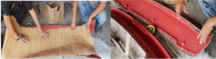
a. Preparation of rattan fibers and positive molds