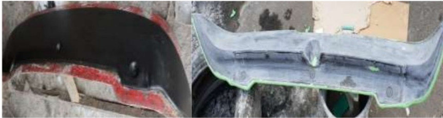
b. Manufacturing process of car spoiler