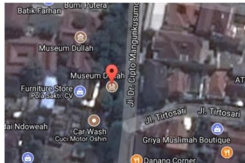
Figure 3: Visualization on maps