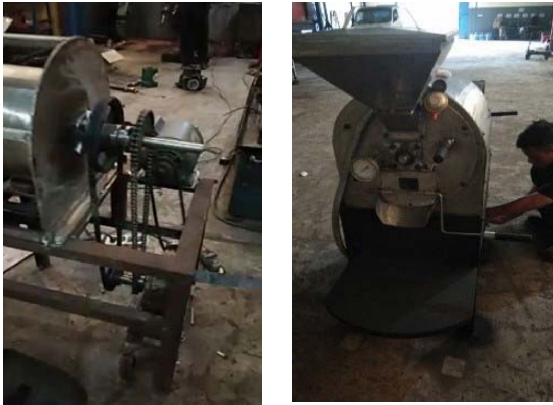
Figure 6 Coffee Roasting Machine