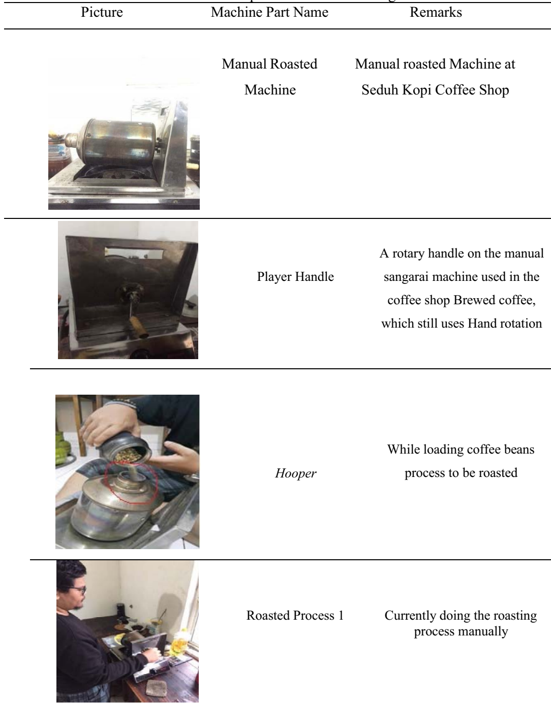
Table 1. The Job Description of Coffee Roasting Machine Manual