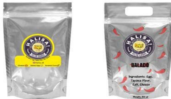
Gambar 3. Konsep Rancangan

The results of the follow-up questionnaire showed that the flavor variants of interest by consumers were the taste of cheese, salted eggs, and roasted corn, while for the spicy variants the most popular was the flavor of balado. The packaging design for the 4 clusters is represented by two design concepts as shown in Figure 3, this is because the results of Table 4 show that each cluster has an attribute level equation. The combination of products that are consumers' preferences of each cluster can be seen in Table 5.