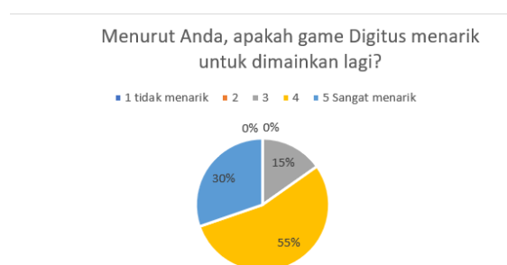
Picture 3 Interesting Digitus game percentage

Based on beta testing that has been done on the Digitus game, the UI (User Interface) display is good and the placement of each arrow keynote is appropriate, the tutorial display is easy to understand so that it can help players understand how to play the Digitus game.