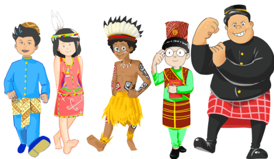
Figure 12: All characters