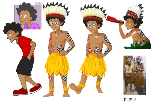
Figure 9: 3 rd character design, Kribo