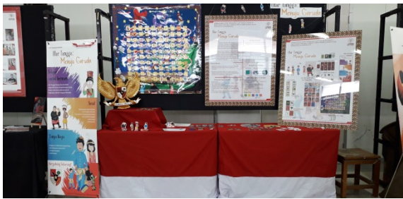
Figure 6: The design of Boardgame for Learning Pancasila