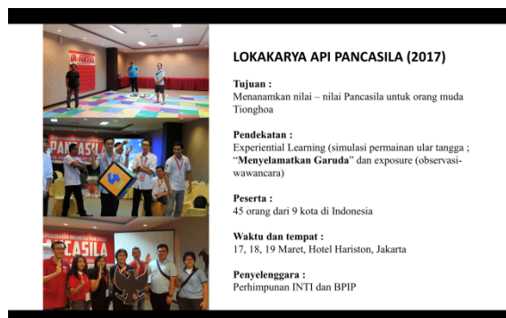
Figure 2: The Snakes and Ladders game "Save Garuda"

The subjects in this study were participants in the simulation of the Pancasila Snakes and Ladders game which was held on April 22, 2019. The research subjects were 30 students of the Creative Experiment class. Research Object is a prototype of the Pancasila Snakes and Ladders game developed from board game, final project, Randy (Faculty of Visual Communication Design of Universitas Tarumanagara student).