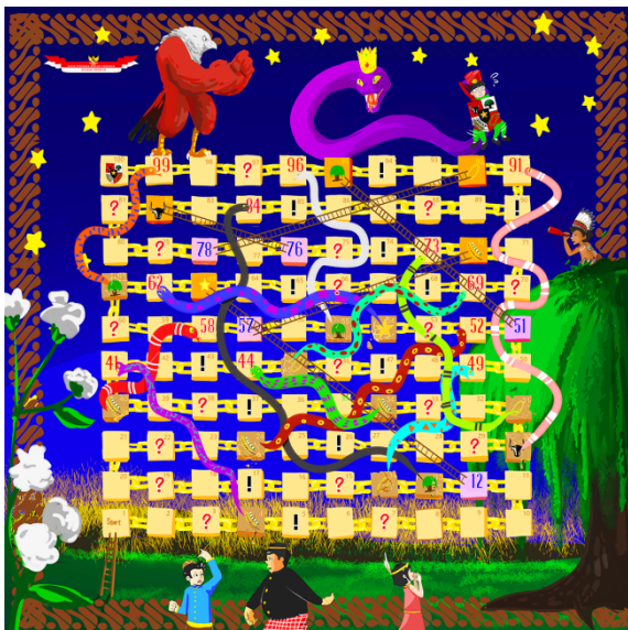
Figure 13: The final design of boardgame