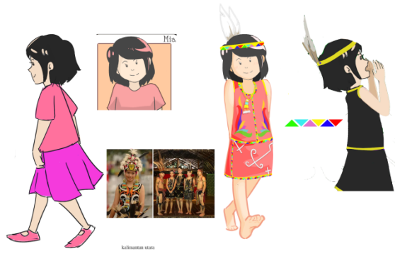
Figure 8: 2 nd character design, Mia