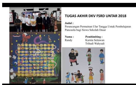
Figure 3: Final Project of DKV FSRD Untar