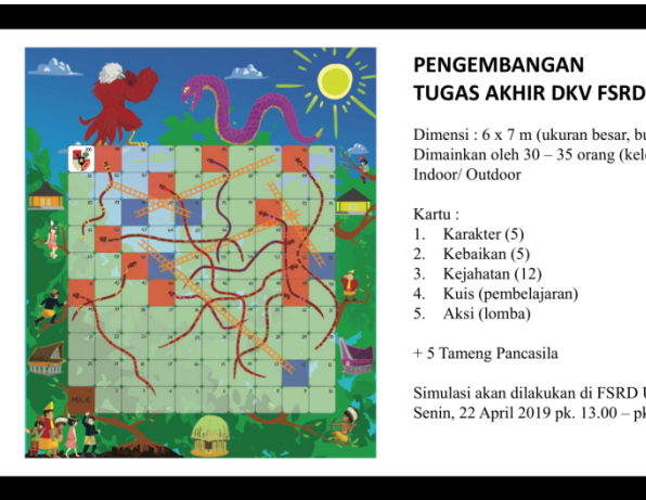
Figure 5: Development of Untar DKV Student Final Assignment