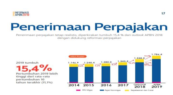
Figure 1 State-Revenue Rate

The General Directorate of Tax (GDT) continues to reform itself and strive for the majority of revenue to be increased. Reformations are done in form of changes to regulations or laws that are continued to be carried out gradually by the government so that the State Revenue can be increased from policies, counseling, tax sanctions, to law enforcement. The self assessment and withholding system adopted and implemented in Indonesia still opens the opportunities for individual and corporate taxpayers to pay their taxes that are not in accordance with the applicable laws and regulations.