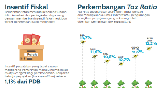
Figure 2 Tax-Ratio of Tax Receipts

This is evidenced by the slowing pace of state revenues in 2014-2019 (Figure 1) and the tax-ratio of tax revenue is weakening (Figure 2).