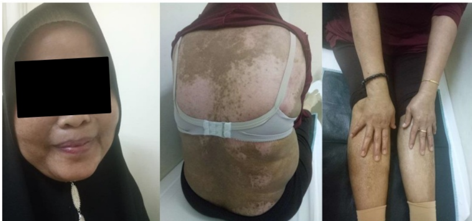
Figure 6: Patient condition after 1 week discharge from the hospital.

at admission is 3.6 mg/dL, but after treatment albumin levels tend to fluctuate, until the lowest albumin level obtained 2.4 mg/dL on day-14 of treatment. In adult case, albumin at admission is 2.2 mg/dL, during treatment albumin levels also tend to fluctuate, but have never been found lower than initial results. In this patient, complete skin healing occurs at 3 weeks after treatment. When healed, the hypo- and hyper-pigmented parts of skin are visible Graphic 1 .