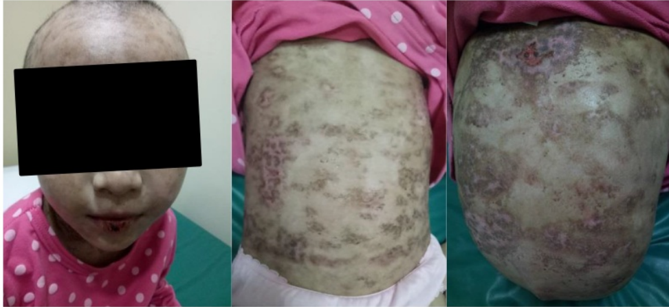
Figure 3: Patient condition after 1 week discharge from the hospital.