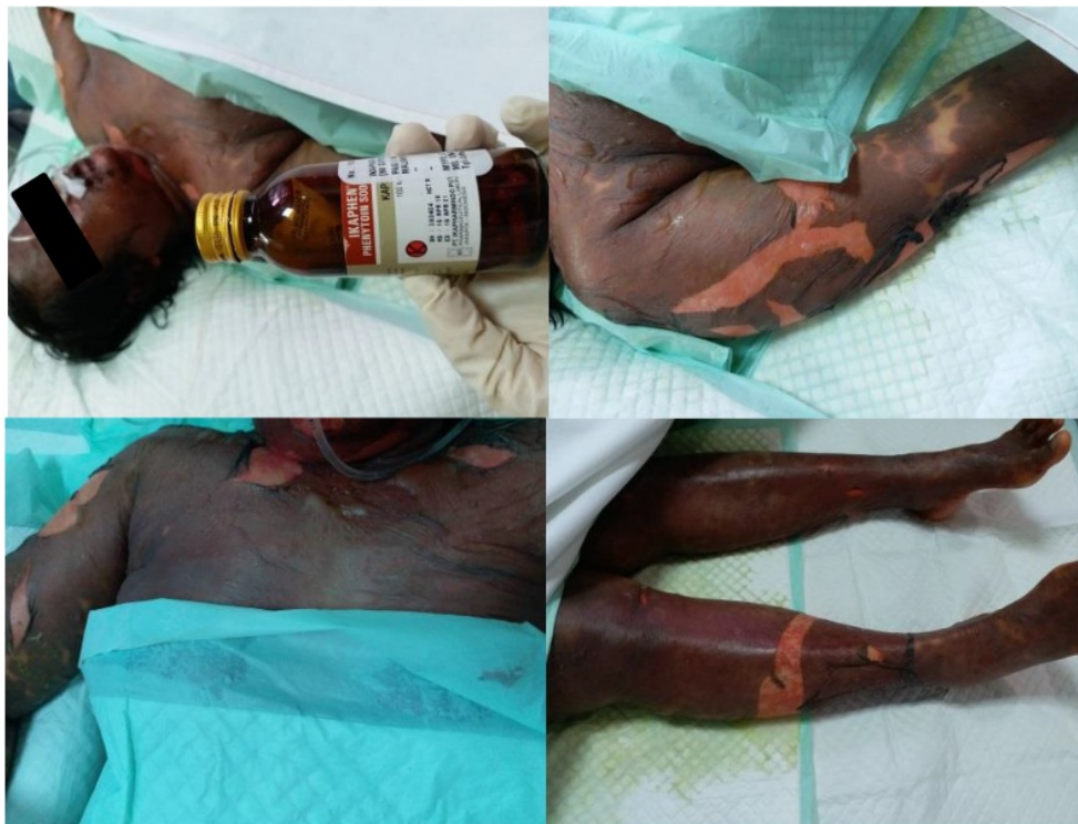
Figure 4: Early treatment period.