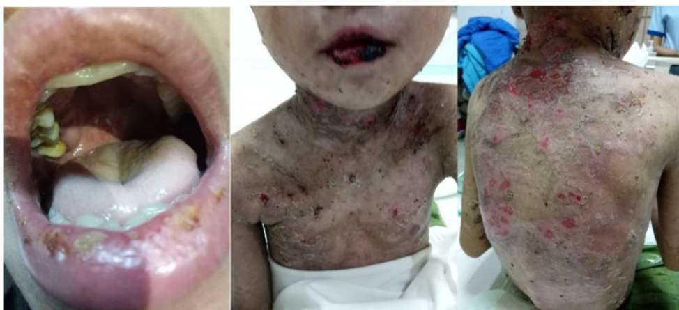
Figure 2: Skin and mucosal conditions in healing phase.