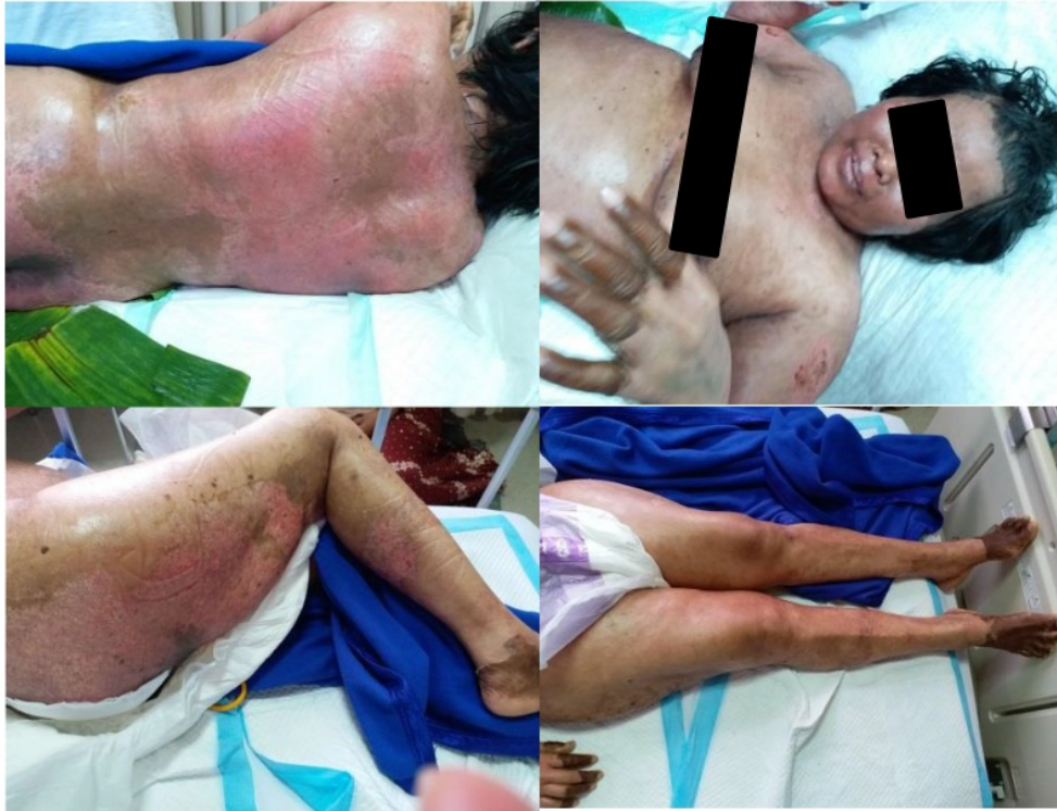
Figure 5: Skin and mucosal conditions in healing phase.