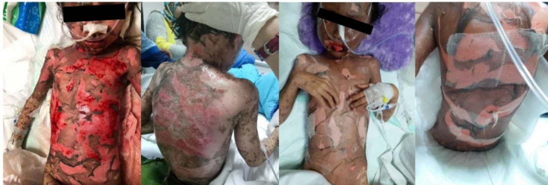
Figure 1: Early treatment period.

Both patients recovered without complications and were discharged from the hospital (Figure 1, Figure 2, Figure 3, Figure 4, Figure 5 and Figure 6).