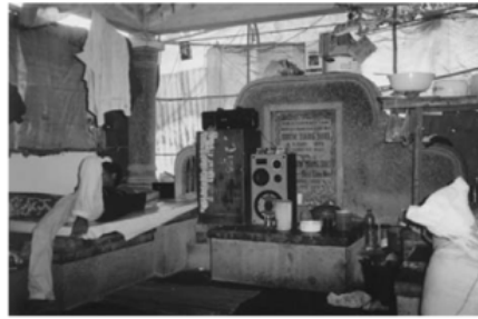
Fig. 5. Cemetery squatter shelter.

a scavenger, utilized bits and pieces of material found during scavenging, such as pieces of wood, partial multiplex boards, aluminium sheets, cartons etc. During our fieldwork, Pak Rusdiono was collecting bricks and worn tiles for future improvement of his house.