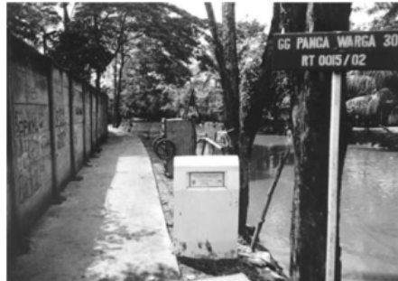
Fig. 3. Formal address of Kampung Penas Tanggul.

the 1997 eviction, each household was given Rp. 150,000 for compensation. Four of the households (one of them is a widow) for some reason did not receive any compensation, but ISJ provided them with a ‘solidarity’ fund of Rp. 100,000 per household.