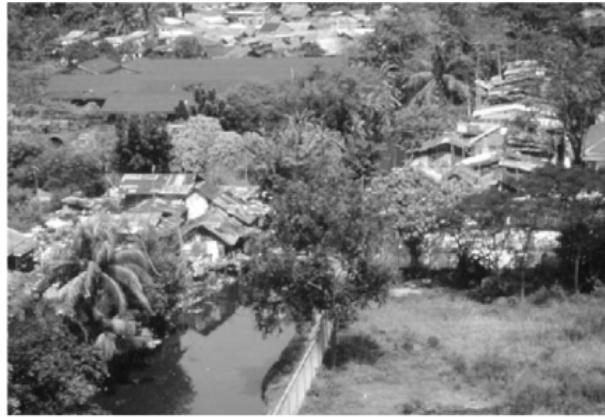
Fig. 1. Kampung Penas Tanggul (July 2000).