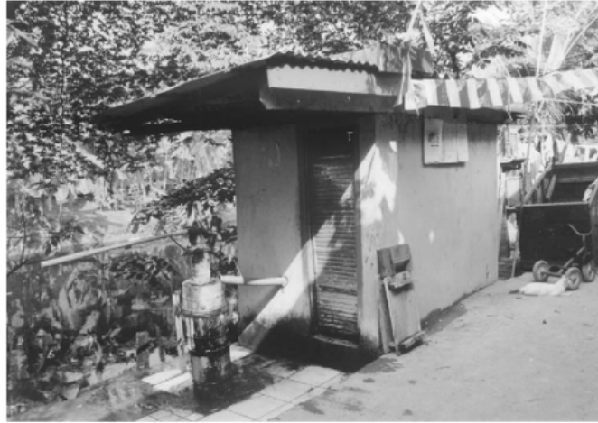
Fig. 6. Common MCK facility.

After obtaining RT status, the kampung was eligible to receive government and foreign donor aid. Recently the WVI implemented a project (funded by USAID) providing the community with improved pavements, a garbage collection point, and additional public toilets. The newly built communal toilets under the program are 10 m away from the riverbank with a septic tank to minimize river pollution. This infrastructure development under the WVI program had increased the residents' technical capability and health awareness. In exchange for their labor (5 h per day) in this program the residents received rice, cooking oil and red beans.