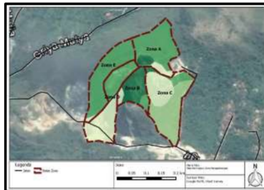
Figure 1. Development Zone Distribution Map

In the following is the placement of activity area based on the slope and contour which has been divided into zones. The division of zone can help in the distribution of development stages within the area.