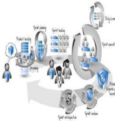
Figure 2: Scrum Framework

Scrum is a framework for project management that has Product Backlog and Sprint Backlog artifacts. Here, the author uses web-based Enterprise Resource Planning (ERP) software development project data. Based on the results of needs analysis and interviews with users, user needs are obtained in the form of Backlog Items (user stories). From the Backlog Item that has been created, it will then be transformed into the SCRUM framework. More detail, described in figure 2