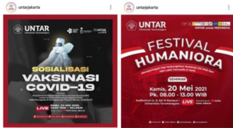
Figure 2. Flyers on social media to inform important activities

Some of the impressions published through social media related to the introduction of the advantages of higher education through various forms of design models are as follows: