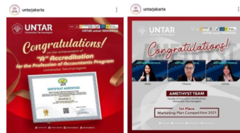
Figure 4. Use of flyers on social media to inform various achievements

The next example is content about achievements that want to be informed to the public related to the achievement of a certain achievement. Information is packaged in such a way as to become a unified whole with display design, communication language, and evidence of achievement as support. All information is packaged briefly, concisely, and attractively (Figure 4).