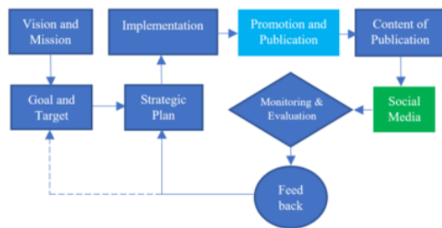
Figure 1. Social media implementation framework

The implementation of social media in various commercial activities to promote product excellence and sell products to consumers online has become a worldwide trend. The discussion in this paper includes focusing on introducing the advantages of a study program from a university to prospective students and the wider community. The steps for using social media are adjusted to the vision and mission of the study program, the objectives to be achieved, planning and implementation strategies, promotion, use of social media, evaluation and monitoring, feedback, and further development plans. The discussion is accompanied by examples of cases of using content on social media in introducing the advantages of study programs and the responses obtained from visitors to the content that is broadcast [4], [5].