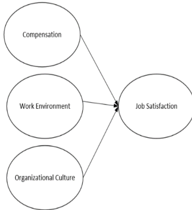
Figure 1. Research Model

determination (R-square) and predictive relevance (Q-square) were tested to test the structural model. Meanwhile, path analysis (path coefficients), effect size (f-square), and significance test (t-test and p-value) were performed to test the research hypothesis. Model of the research is as follows: