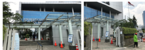
Figure 4 Pathway No. 1