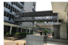
Figure 9 Sky bridge