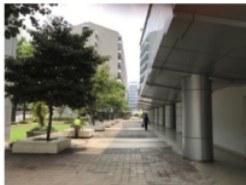
Figure 7 Arcade no.3

Next to the left, there are tub plant -shaped boxes. Then, the area serves as a place to sit, central hollow to planted trees shade. More towards the left, there is a field of grass and a pond with a water fountain. Next to the right, there is a canopy of concrete. It was coated aluminium composite panel that adds to the majestic. The canopy is past the crossing no.1 heading to post a security guard, so it can be as a shade and paths pedestrian foot at a time when rain. In front of the right (Figure 6) there is a duplicate of the Tarumanagara Kingdom inscription.