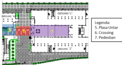
Figure 16 Pedestrian Path No.7 design

protect the user against the scorching sun and bush not been arranged properly. Then pedestrian foot until at entrance hall elevator. This terrace has a temple stone floor and is coated with a wet look coating that is not slippery when it rains.