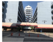
Figure 15 The Perspective of Crossing No. 6

The results of the analysis of Crossing No. 6