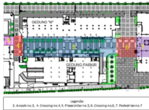
Figure 10 Plaza Untar

parking available ladder (Figure 12), the ladder is coated granite tile with a smooth surface so smooth if wet. High optrede 21 cm and width antrede 30 cm pretty steep, especially users who are aged above 50 years, the slope of the stairs the tune of 28^{\circ} - 36^{\circ} (Francis DK Ching, 1997 image 13).