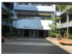
Figure 17 The Perspective of Pedestrian Path No. 7

The result of Pedestrian Path analysis No. 7.