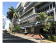
Figure 12 Parking Building