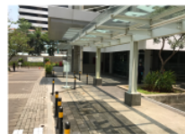
Figure 8 Transparent pergola

The results of the analysis of crossing no. 4. The surface of the crossing floor is made of paving blocks with a rough surface so it is not slippery when it rains to improve pedestrian safety. In addition to the image of a zebra cross, rubber lanes should be added that can vibrate the vehicle so that vehicle drivers are more careful and reduce vehicle speed. At the crossing no.4 section open at noon -day heat and soften the rain wet, but there was a skybridge floor 2 which contact the building parking lot to the building principal (figure 9) as the path circulated an alternative in times of rain.