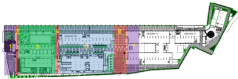
Legenda: 1. Pedestrian no.1, 2. Crossing no.2, 3. Arcade no.3, 4. Crossing no.4, 5. Plasa Untar no.5, 6. Crossing no.6, 7. Pedestrian no.7.

analyzed using landscape theory about the condition of materials, vegetation, atmosphere and activities on the pedestrian campus I Untar, then the findings were obtained.