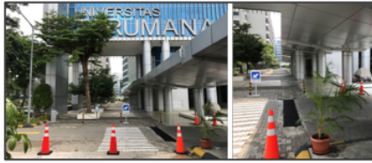
Figure 5 Crossing No. 2