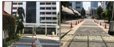
Figure 14 Crossing No. 6

behind which the parking area attached to building L is planted with shade trees. In the background (Figure 14) a steel pergola with a glass cover can be seen that connects the M building and L building for an alternative circulation path and can be used on rainy days, a glass pergola. A continuation of the plaza no.5, the floor is made of paving blocks that are not slippery at a time when the rain, but in the afternoon the day was hot because it is not covered roof or tree protectors and should cross the path of the vehicle and no there is a zebra crossing (Figure 14).