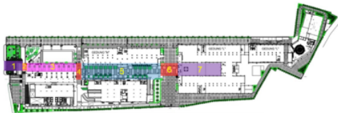
Legenda: 1. Pedestrian no.1, 2. Crossing no.2, 3. Arcade no.3, 4. Crossing no.4, 5. Plasa no.5, 6. Crossing no.6, 7. Pedestrian no.7

The pedestrian path for Campus I Untar starts from the S Parman access road: Pedestrian path no. 1, crossing no. 2, arcade no. 3, crossing no. 4, Plasa no. 5, crossing no. 6 and pedestrian path no. 7 ending at L & J Building Elevator (Figure 2).