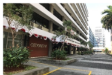
Figure 11 M. Building