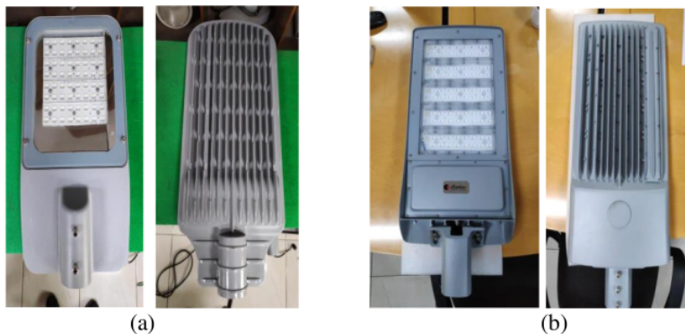
Figure 2. Lamp housing of LED Luminer for Street Lighting (a) CSL14 and (b) CSL19