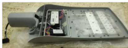
Figure 3. Position LED Drivers in Lamp Housing

LED driver has a maximum power of 150 Watt with a current of 0.7 A (constant electric current). On measuring power using a constant current of 0.7A, an LED driver will produce a voltage based on a load from 85 Volts to 214 Volts Maximum. In the current study, based on the use of the led light module, the current driver used is the right module. However, if the usage per lamp module has different current consumption, then a different LED driver module is needed. At the core of the LED driver module must be adjusted to the use of the required constant current, this is reasonable because in assembling the LED light circuit is a series so that the current used will be the same based on the laws and theories of electric current.