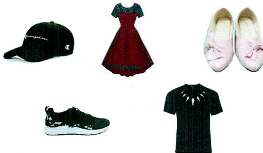
Figure 1. Example of fashion product