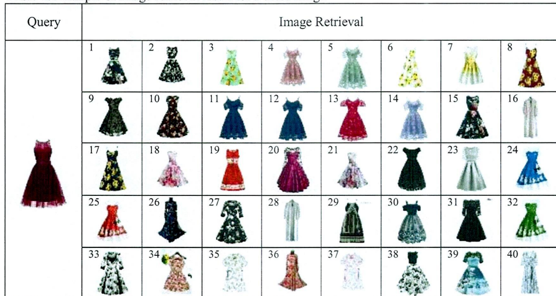
Table 2. The result of four experiment scenarios