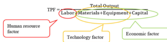
Figure 2. Representation of Total Production Factor (TPF) (Source: Hwang and Lim 2013).

construction firms due to the relationship between the influence factors, firm size, and experience. Moreover, Khoshgoftar et al. (2010) stated that, according to the Office for Supervision and Evaluation of Designs (2015), Iranian construction projects experienced a delay of about 30%, 74.5%, and 75% in 2001, 2002 and 2003, respectively. Therefore, a delay is a serious problem in Iranian construction projects that could be accepted as a habit in case no concrete preventive steps are taken. Several factors were found to cause the delay in the construction project.