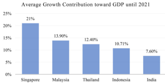
Figure 1. Construction Sector Contribution Towards Gross Domestic Product (GDP) in Several Developing Countries Chart (Source: Official statistic record from each countries).