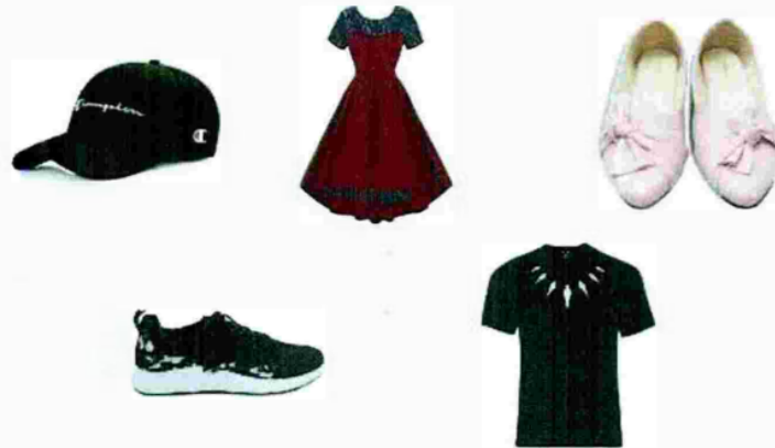
Figure 1. Example of fashion product