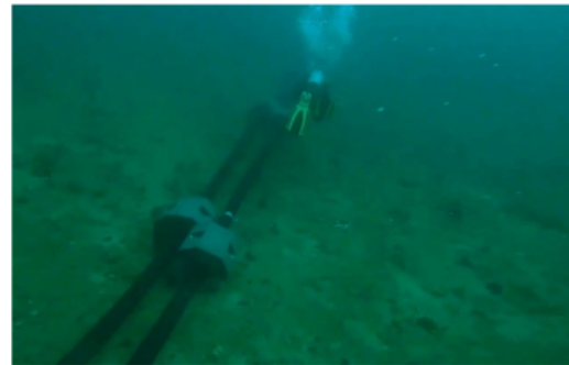
Figure 3. Freshwater pipeline on the seabed of Limbo Strait

With a sea depth of 47 m and a reservoir height at the location of the water treatment plant at 51 m above sea level, the water level difference in the deepest pipe is 98 m. To WTP the water hammer that can occur when the water stops flowing suddenly, which can cause a pressure twice the normal pressure of water in the pipe, a pipe with a nominal pressure of 20 bar is selected. Table 1 presents the detailed the specifications of the selected pipe.