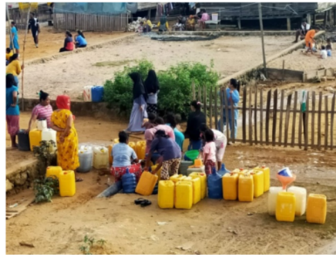
Figure 5. People rushing to collect water at the end of an overflow reservoir pipe