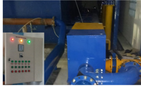
Figure 4. Micro-hydro installed in water treatment plants

The calculation results show that the installation of micro-hydro at the transmission pipe unit by utilizing water energy before entering the water treatment plant can meet the WTP's electrical energy needs which consist of a chemical system (compressors for pneumatic systems, lighting and other electrical needs). With the installation of micro-hydro, the energy used in this system is environmentally friendly (green energy). In this development, a micro-hydro power plant of 12.5 kW is sufficient for electricity needs at the water treatment plant, so that it can be used for lighting around buildings and access roads. The installed micro hydropower is shown in Figure 4. The micro hydro is installed at the bottom by utilizing the water pressure from the intake before entering the WTP. The micro hydro position does not interfere with the WTP work system, in fact it is very supportive in providing cheap and environmentally friendly electrical energy sources, so this technology is very effective to apply.