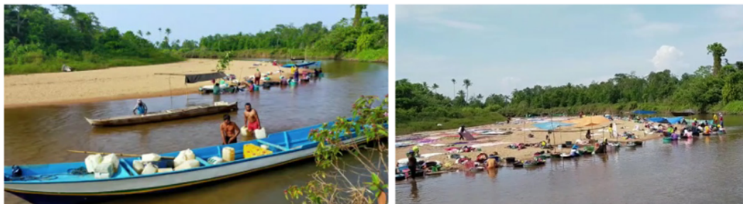
Figure 1. People of Limbo Island washing clothes, bathing and taking water from Beringin River on Taliabu Island

The water supply utilises environmentally friendly technology, which is classified as green technology; such technology is used in the water flow system in the transmission and distribution pipes, all of which are gravity and do not use fossil fuels as an energy source [18-20]. In the water treatment plant, conventional WTP is used, which operates with the flowing fluid and also does not require electrical energy to pump water.