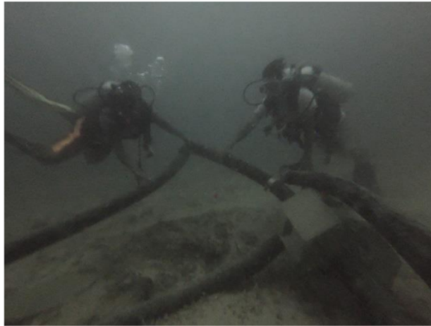
Figure 1. Examples of underwater pipelines damage