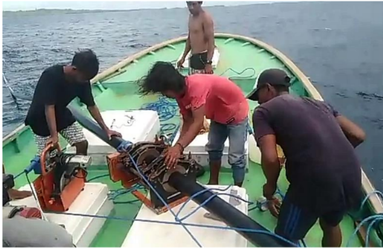
Figure 4. Pipe connection that has been floated