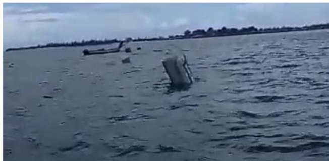
Figure 3. Floats that arise on the surface