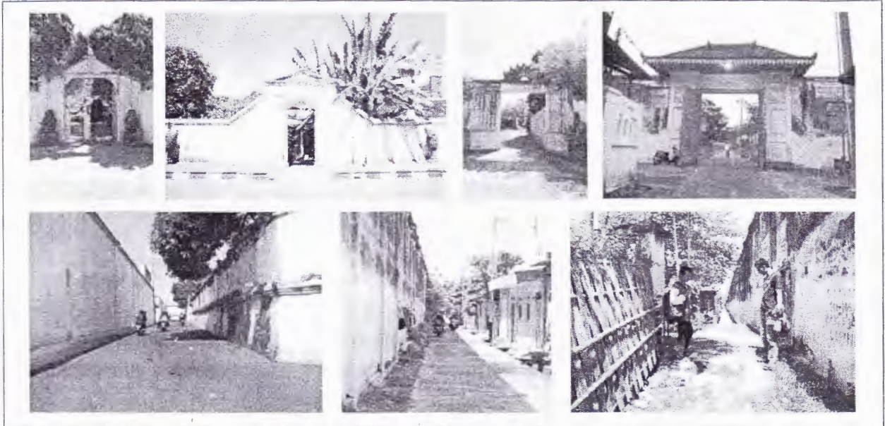
Figure 3. Prototype of gates in "kampung" Baluwerti.