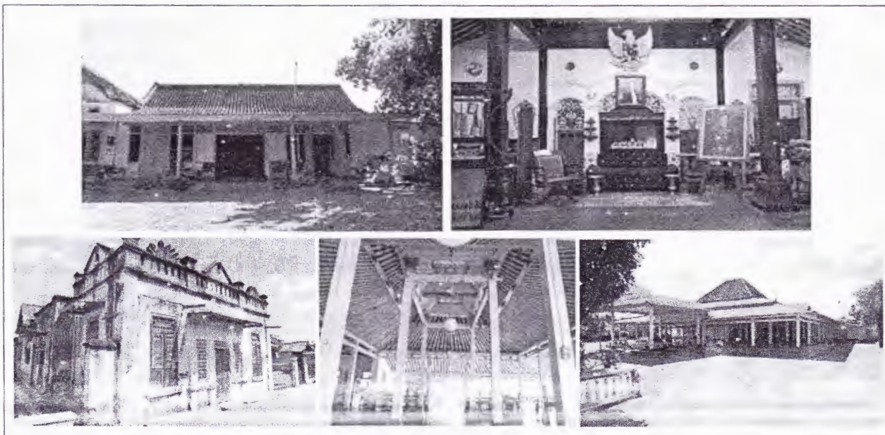
Figure 5. Prototype of Pangeran house.