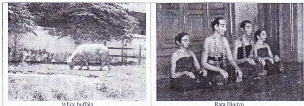
Figure 6. Examples of symbol in the palace as an attempt to demonstrate the power of the king.

This regard is done with intention to seek the loci estimated to store theoretical samples related to research focus. For locus suspected to store the discrete phenomena (acronym from continue) such as social situation related to research focus and proper to designated as a theoretical sample, it is immediately conducted with mini grand tour (visceral observation) and with the objective of determining the observed units.