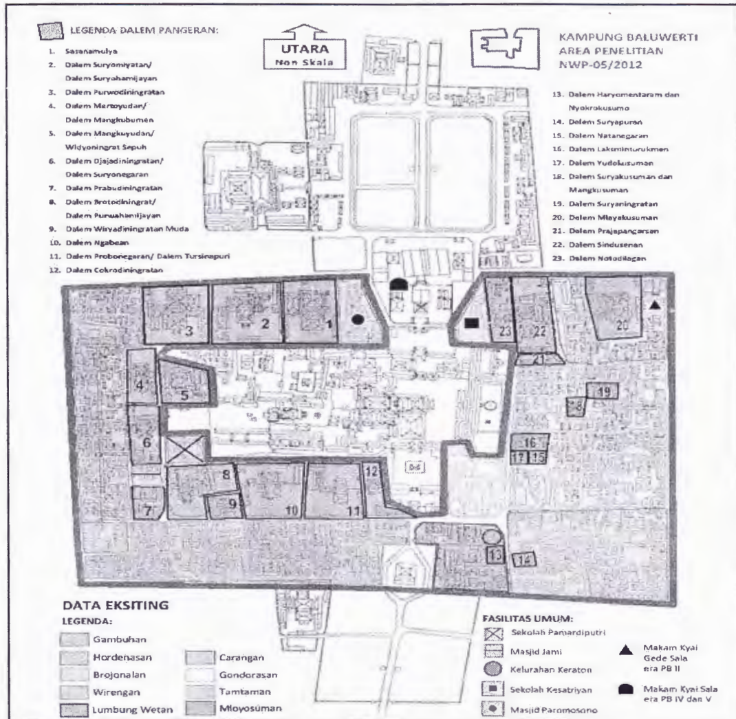
Figure 1. Map of Keraton Palace complex.

room/Pandapa that is a large room of Dalam/Dalem with 4 pillars/saka guru, and has a canopy in front of Pendapa that functions to download and upload passenger from carriage or horse cart). Figure 6 presents examples of symbol in the palace as an attempt to demonstrate the power of the king.