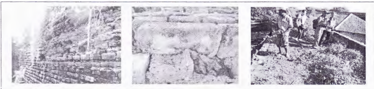
Figure 4. Ruin of masonry wall (the surrounding wall of Paku Buwono II's era).